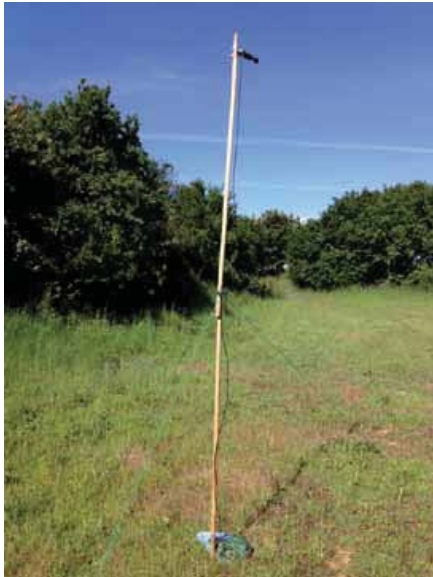
Automated bat detector with microphone mounted at 2 metres above the ground at the planned location of wind turbines.

a representative number of turbine sitings in each type of habitat, relief and topography present (for example: hill tops and valleys).