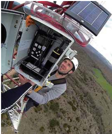
Automated detector system installed at a meteorology mast in France.

Automatic recording bat detector (high resolution ultrasound recorders or frequency division detectors – see below) should be placed on meteorology masts, wind turbines or other suitable structures in the vicinity of the proposed wind farm to establish a bat activity index and species composition throughout the bat active period