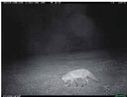
Fox scavenging pipistrelle's carcass at night under a wind turbine in France.

To estimate scavenging and predation, trials must be carried out 4 times a year in order to take into account seasonal changes in predation rates caused, among other things, by differences in vegetation height and variations in the activity of scavengers throughout the seasons.