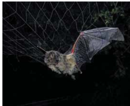
Mist-nets can be used to confirm the presence of some species: B. barbastellus caught during survey in Macedonia.

As previously stated, wind turbines should not be installed within woodland or within 200 m due to the high risk of fatalities. However, in countries where this is still allowed, in addition to the manual detector surveys described above, bat activity should be monitored above the canopy using an automated detector system. The system should be set to record bat activity at the proposed turbine locations during the bat active season, from one hour before sunset to one hour after sunrise. It is also recommended to use mist nets, in order to confirm the presence of species that are very difficult to detect or recognise by acoustic methods.