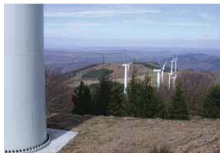
Wind farm built in 2002 (Aveyron, France) on a ridge at the edge of a beech forest. At that time there was little work on the impacts of wind turbines on bats and no EIA on bats was done.