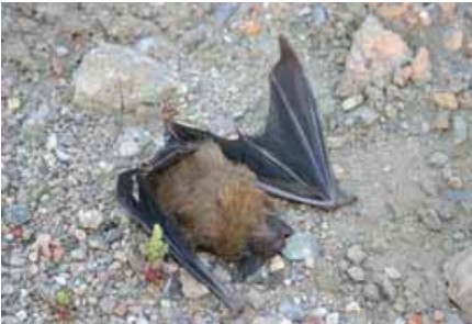
Noctules (N. noctula) are the species most affected by wind turbines in Germany (here at Puschwitz in Saxony). Migrating as well as local populations of different bat species are found throughout Europe as casualties under wind turbines.