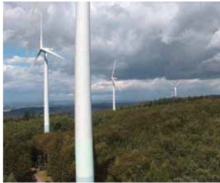
Wind farm in the Black Forest in Germany. A local population of common pipistrelle ( P. pipistrellus ) was affected by these wind turbines, as well as migrating species such as Leisler's bat ( Nyctalus leisleri ).

In Northern European countries with high forest cover it may be necessary to include forests in the selection of sites for wind farms because of the lack of alternative locations. The importance of such areas for bat populations needs to be considered at a strategic level during the planning process. In these circumstances, particular attention should be paid to national guidance and to the planning process so that wind turbines are not sited in areas important for bats.