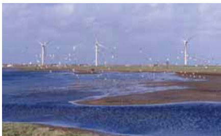
A wind farm in Bouin (Vendée, France), on the Atlantic coast, where migrating bats are regularly found dead under the wind turbines. The species concerned are mainly Nathusius pipistrelles ( P. nathusii ), noctules ( N. noctula ) and common pipistrelles ( P. pipistrellus ).

Migration routes over land and offshore should also be considered. Particular consideration should be given to bat migration when wind turbines are proposed close to prominent landscape features such as river valleys, upland ridges, upland passes and coastlines. For offshore proposals, the location of the wind turbine in relation to migration routes between principal land masses and islands should also be taken into account, especially where there are records of bats on islands, oil rigs, etc.