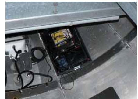
Remote microphone installed at the nacelle's bottom (above) and connected to automated bat detector inside the nacelle (below).

of the year and night using an algorithm that predicts risk of fatalities from these data.