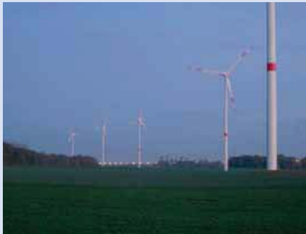
The permit delivered for these 5 wind turbines (Perwez, Wallonia, Belgium) includes blade feathering because migrating bat species had been detected during the EIA.