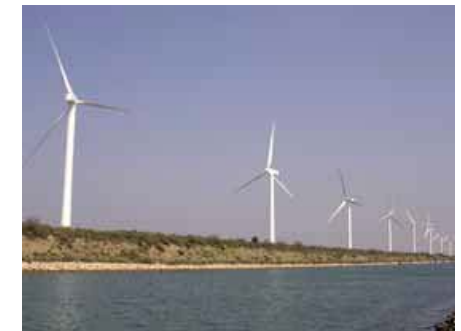
A wind farm in the Camargue delta (southern France). 21 wind turbines were built on an embankment in 2005. In 2006, 12 dead bats were found, among them Schreiber's bent-winged bats ( M. schreibersii ). The building permit was granted at a time when no bat survey was needed for an impact assessment, although this wetland area (Ramsar site) is a hot spot for wintering birds and migrating and foraging bats.

or coniferous woodlands, wetlands and grasslands, even as small patches in expansive agricultural landscapes, and landscape features such as hedgerow networks, individual trees, water bodies or water courses increase the likelihood that bats may roost, forage and/or commute in these areas. Therefore, disturbance of these habitats should be avoided.