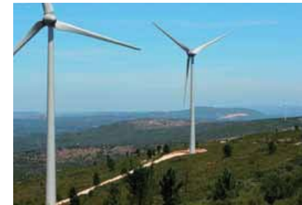
In Portugal, this 7-turbine wind farm has one located 158 m from an important hibernating roost (around 4000 Miniopterus schreibersii and 150 Rhinolophus ferrumequinum ). The cut-in speed of that turbine is increased to 5 m/s in October, November, December, March and April.

Power loss and the economic cost of blade feathering and increase of cut-in wind speeds are inevitable in most cases, but studies have shown these to be negligible, e.g. <1% of total annual output (BRINKMANN et al. 2011, ARNETT et al. 2013c). Finely tuning pre-construction rough cut-in speed and temperature thresholds into refined post-construction site- and species-specific multifactorial models very efficiently reduces excessive production losses and bat fatalities at the same time (LAGRANGE et al. 2011, 2013).