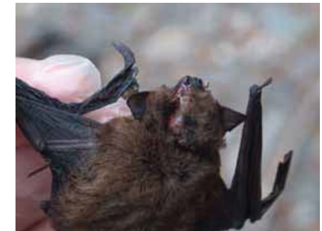
A common pipistrelle (Pipistrellus pipistrellus) found dead with broken skull under a wind turbine (Germany).

lished that wind turbines can have negative impacts on bats ( e.g. ARNETT et al. 2008, BAERWALD & BARCLAY 2014, RYDELL et al. 2010a, LEHNERT et al. 2014). Bat mortality at wind turbines occurs due to collision and/or barotrauma (ARNETT et al. 2008, BAERWALD et al. 2008, GRODSKY et al. 2011, ROLLINS et al. 2012).