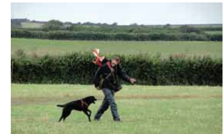
Surveyor in the UK setting out on search with dog: flags for marking the locations of dead bats.

toring, but the efficiency of a dog-handler team must be tested the same way as above at each site (ARNETT 2006, PAULDING et al. 2011, PAULA et al. 2011, MATHEWS et al. 2013). Carcass decomposition and weather conditions such as wind speed and air temperature can play important roles in dogs scenting capabilities (PAULA et al. 2011) and should be taken into account. It is advisable that dogs and dog handlers attend organized training. If applicable, dog handlers need to obtain a licence for this purpose. The contract with the dog handler, who will always work with his dog, should specify if such training was received. Dogs can use different methods of marking such as barking and pointing. This is preferable to a dog trained to retrieve, as the bat carcass will be identified but left in situ for the surveyor to make notes as necessary. In difficult terrain (thick undergrowth) pointing dogs are often equipped with a beeper collar that changes its type of signal when the dog is pointing. Dogs are already being used to increase the efficiency of the search in some countries in Europe such as: Portugal, United Kingdom, Spain and Germany.