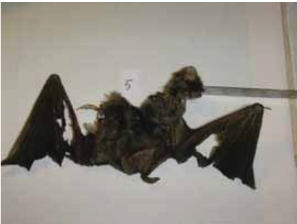
A Schreiber's bent-winged bat (Miniopterus schreibersii) severed from the head to the hips by a rotor blade (Camargue wetlands 2006).