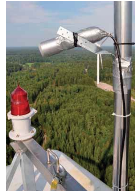
Microphone installed above the nacelle for automated bat detector survey.

Measurement of bat activity at nacelle height from neighbouring similar wind turbines in combination with the search for bat fatalities, will enable an assessment of existing collision issues and a better prediction of the collision risk at the new planned wind turbines than a manual survey at ground level only. If the size of the new wind turbines is not similar to the original wind turbines, as is usually the case in repowering projects, a fatality search should be carried out in order to compare the effect of different sized turbines.