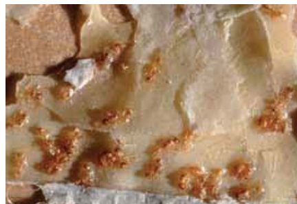
It has been suggested that bats may be attracted to insects around wind turbines: swarming ants caught in sticky insect trap (right photo) installed at the nacelle (left photo) in Sweden.