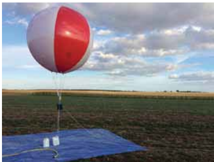
Automated bat detector attached to a balloon for bat activity survey during EIA.

Experiments with automated bat detectors attached to kites or balloons ( e.g. FENTON & GRIFFIN 1997; SÄTTLER & BONTADINA 2006; MCCrackEN et al. 2008; ALBRECHT & GRÜNFELDER 2011) have shown that these methods provide data of limited use. This is because bats appear to behave differently at height when structures (such as wind turbines and masts) are present in comparison to when these structures are absent. In the absence of structures, bats appear to be rare at height (GRUNWALD & SCHÄFER 2007, AHLÉN et al. 2009, ALBRECHT & GRÜNFELDER 2011).