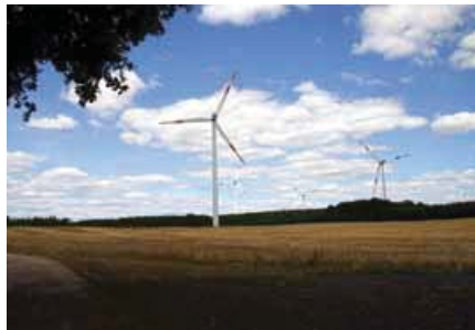
Wind park Puschwitz in Saxony, Germany: 10 wind turbines are situated in a hilly landscape with highly diverse habitats, including many water courses. Between 2002 and 2006, 76 dead bats were found under the turbines, consisting largely of noctules ( N. noctula ), Nathusius' bats ( P. nathusii ), common pipistrelles ( P. pipistrellus ) and parti-coloured bats ( V. murinus ).

tivity monitoring will assess changes in bat activity and will also help to understand the results of mortality monitoring.