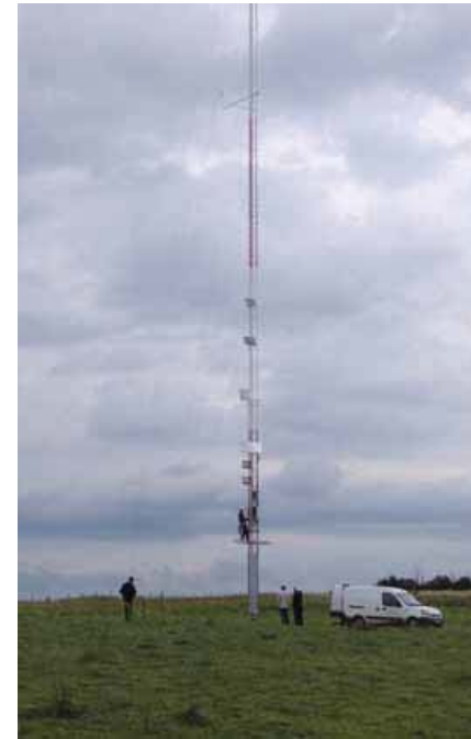
Meteorology mast with automated bat detectors installed for recording of bat activity at the height of the collision risk zone, France.

Given the potential impacts of wind farms on bats, it is essential (for an accurate and complete impact assessment) to take into account the full cycle of bat activity throughout the year. This includes investigating the possibility of hibernation roosts being present and surveying them if they are. The cycle of bat activity can start in mid-February and end in mid-December, but is likely to be shorter in northern parts. In some regions of southern Europe (e.g. coastal Greece and Montenegro), hibernation may be absent and surveys should therefore continue all year round. The in-