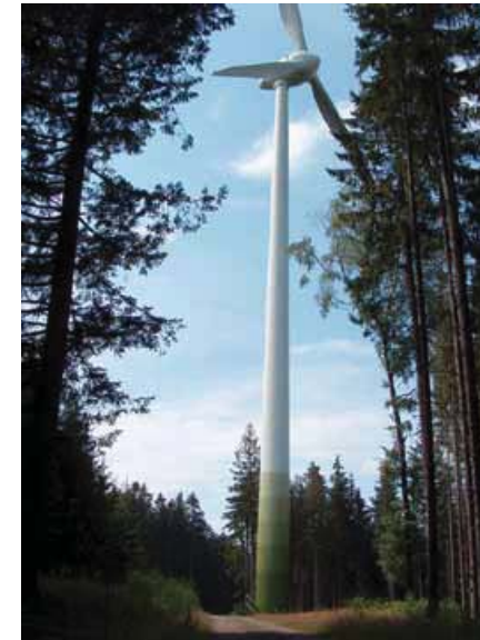
The setting of wind turbines in woodlands is highly dangerous for bats and therefore not recommended and criticized by the present guidelines.

N. noctula was most often killed at wind turbines that were at a mean distance of 200 m from wooded areas (DÜRR 2007).