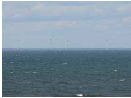
Offshore wind farms, such as this one in Sweden, can have negative impacts on bats when sited on their migration routes.